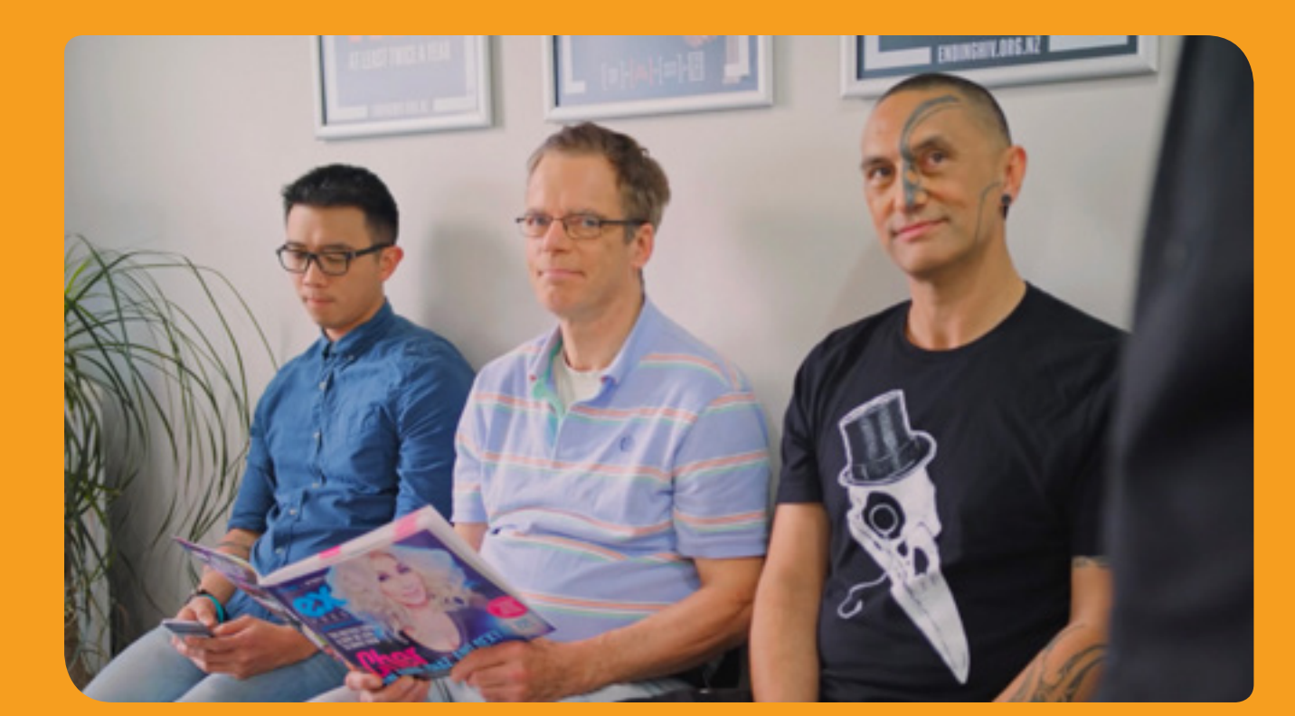
A still frame from our latest testing campaign video, "Good sex is more than just sex".

Deliver targeted and innovative behaviour-change marketing, peer education and one-on-one support to promote regular HIV and STI testing in accordance with risk